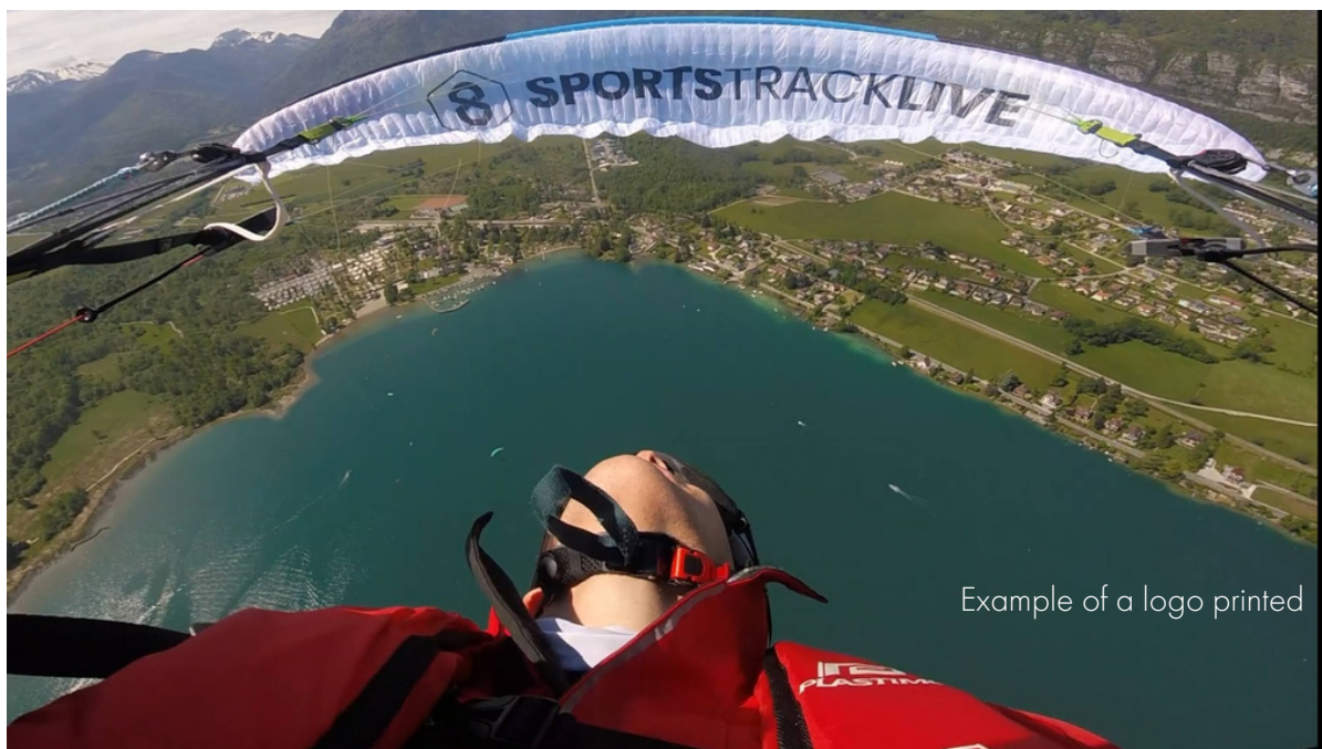
Example of a logo printed